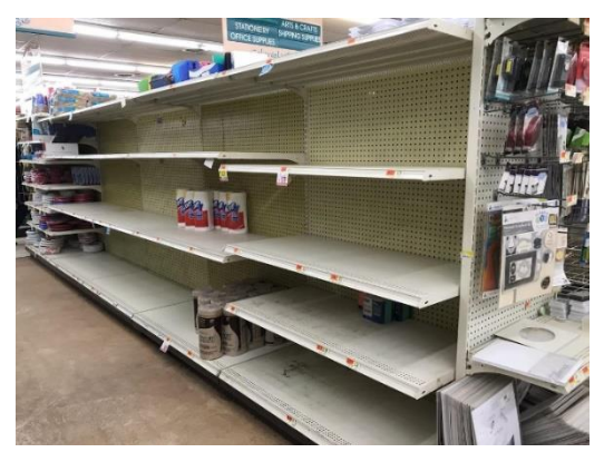
Photograph of the paper goods aisle at Colonial Village in Contoocook, N.H., March 22, 2020.

One hundred years from now, what would you like people to know about the COVID-19 Pandemic of 2020? Hopkinton Historical Society would like to document people's stories of what they are feeling, seeing, and/or doing during these unprecedented times. How has your daily scheduled changed? What are your fears? How long do you think we will have to physically distance ourselves