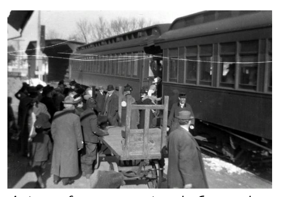
An image of a passenger train at the Contoocook Depot, c. 1940s.

Hopkinton Historical Society is once again taking part in a MUSE (MUseums Sharing Experiences) collaboration. "All Aboard! Economic. Social and Environmental Change During New Hampshire's Railroad Era" will look at the impact of the railroad on rural New Hampshire towns and Native American